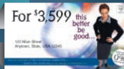
Variable Image Printing

There's never been a better time to discover the power of color —and how it can impact your business. Make your documents come to life with vivid 600-dpi resolution on paper sizes up to 12" x 18". The AR-C270 IMAGER can even print on paper up to 140 lb. Index—so you can print almost anything you can imagine! Communicate your ideas effectively with eye-catching reports, signage, colorful charts, and customized marketing communications. Unleash your creativity and enhance your business image with the ARC-270 Color IMAGER.