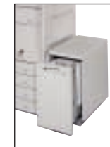
Large-Capacity Paper Drawer

For added efficiency, a choice of optional finishers automates document handling.